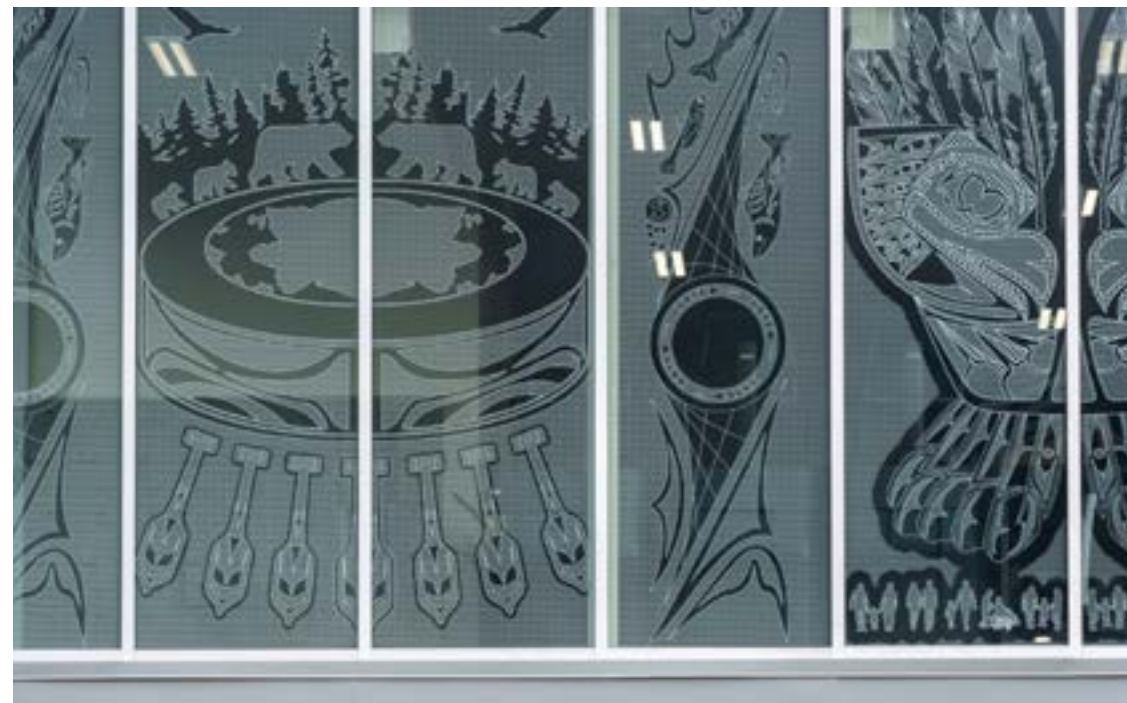
Fritted glass pattern panels Artist: Rain Pierre (s4éməx™) North Surrey Sport & Ice Complex, Surrey, BC